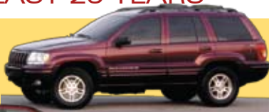
JEEP GRAND CHEROKEE