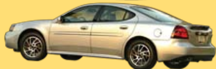
PONTIAC GRAND PRIX