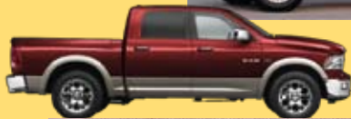
DODGE RAM PICKUP